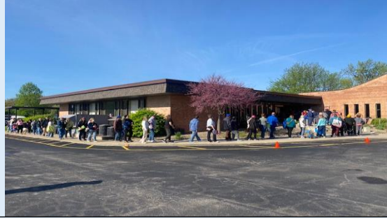
Customers were lined up around the building waiting for the doors to open Friday morning.

Thank you to everyone who set up, tore down, donated, cleaned, baked and served the community at the Spring Group Sale. The sale brought in over $6,465.