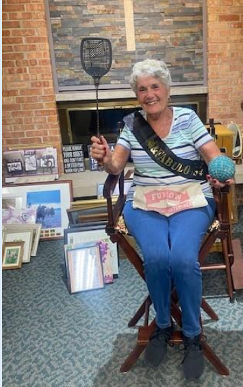
Fun on the main level...

Thank you to everyone who set up, tore down, donated, cleaned, baked and served the community at the Spring Group Sale. The sale brought in over $6,465.