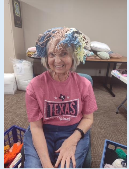
They had some fun downstairs, too!