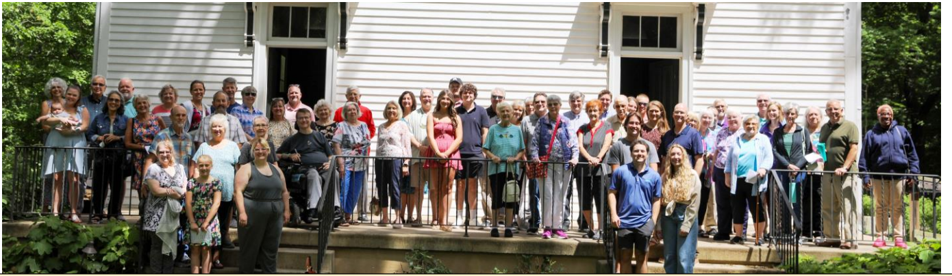
Last month, church members gathered for our annual worship service and potluck at Funks Grove Church. It was a beautiful day to worship together and share a meal.